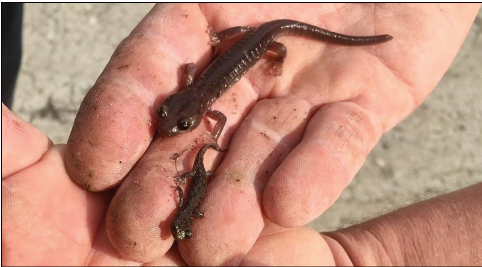
FIGURE 4. Adult and juvenile Arboreal Salamanders ( Aneides lugubris ) collected from under cover objects on East Brother Island, Contra Costa County, California, October 2019.

2018–2019, we conducted an additional, more focused, survey consisting of approximately eight person hours. We checked all potential cover objects (i.e., lumber piles, flowerpots, rocks, etc.), and we placed twenty-two 30 × 30 cm plywood cover boards around the perimeter of the island in areas with surface soils. For four weeks following their deployment, we checked coverboards opportunistically.