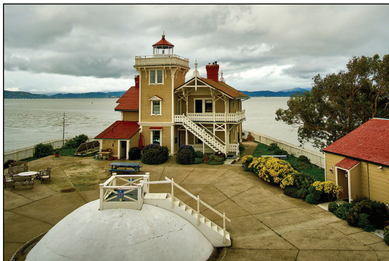
FIGURE 3. Structures and vegetation on East Brother Island, Contra Costa County, California, in 2019.

In Fall 2018 we conducted three separate informal surveys on the island totaling approximately 10 person hours, to determine if any herpetofauna might be present. Generally, we conducted surveys on clear, sunny days > 7 d after a previous rain. We checked every potential basking site and cover object for species that were known on nearby islands, but none were found. In the winter of