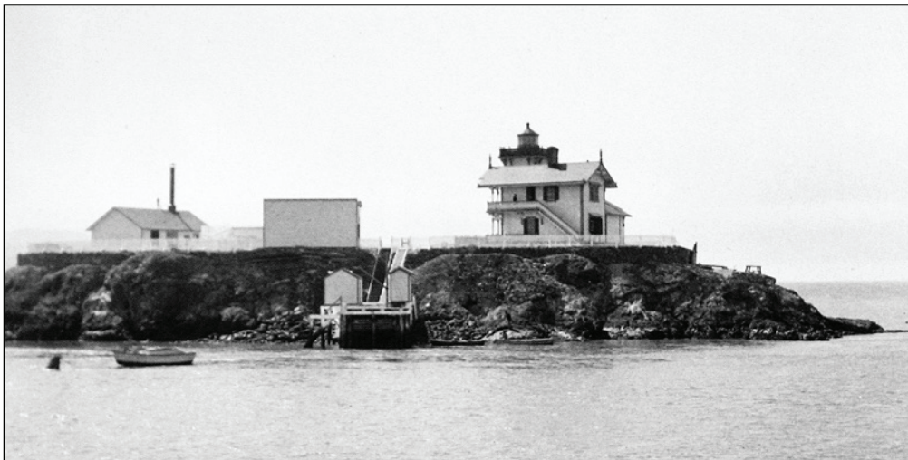
FIGURE 2. Historic conditions (circa 1893) of the East Brother Island, in northwest San Francisco Bay, California, while under the operation of the U.S. Coast Guard. Note the absence of vegetation. (Photograph courtesy of the National Archives and Records Administration).

that supported the roosting and nesting of numerous pelagic birds such as cormorants ( Phalacrocorax spp.), pelicans ( Pelecanus spp.), and gulls ( Larus spp.; Perry 1984). In 1873 the island was leveled for construction of a lighthouse, fog-signal building, and associated structures, which were completed by 1874 (Perry 1984; Fig. 2). Based on a review of historic photos, East Brother Island remained largely barren during the first 100 y of the light station operation, although successive keepers generally kept personal gardens, and presumably planted ornamental plants, because mature Century Plants ( Agave americana ) appear in photographs from the early 1900s. By the 1940s, several Blue Gum ( Eucalyptus globulus ) and Monterey Cypress ( Cupressus macrocarpa ) trees had been planted, and ornamental succulents became much more widespread following the conversion of the property to a Bed and Breakfast establishment in 1980 (Perry 1984). Ground clutter, in